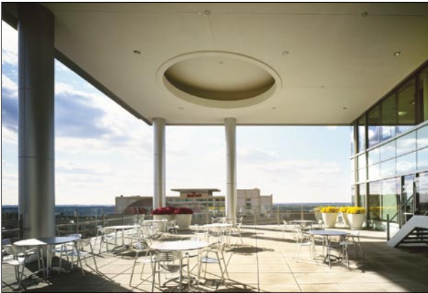
In association with CSO Architects